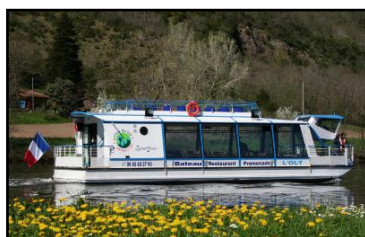
2 x 22 kW batteries