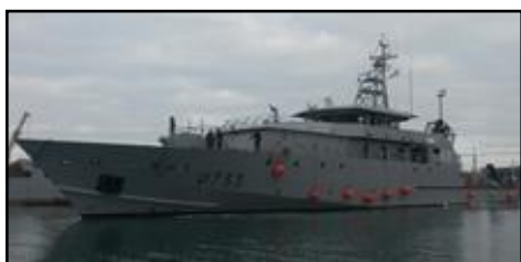
2 x 156 kW hybrid – Navy