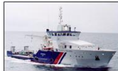
2 x 475 kW + 1 x 340 kW

The information contained in this leaflet is not of a contractual nature. ENAG reserves the right to amend the technical details of its products without advance notice. Please consult us before installing the units.