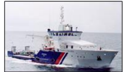
2 x 475 kW + 1 x 340 kW

The information contained in this leaflet is not of a contractual nature. ENAG reserves the right to amend the technical details of its products without advance notice. Please consult us before installing the units.