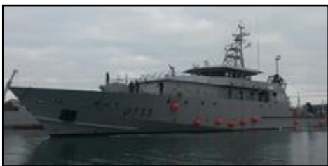
2 x 156 kW hybrid – Navy