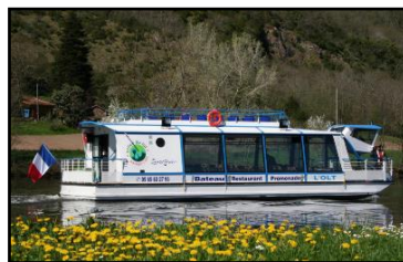
2 x 22 kW batteries