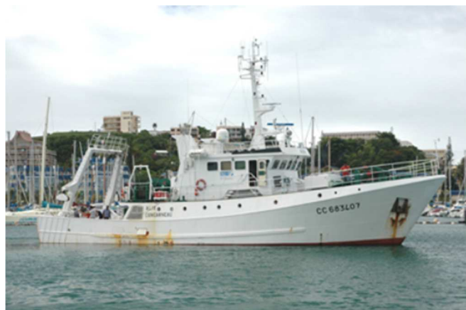
ALIS – Génavir - 150kVA GREEN

A clean energy generator supplying a stable AC electric network 3 Ph 50Hz or 60Hz from variable speed coming from the PTO output of the reducer or shaft line of the vessel.